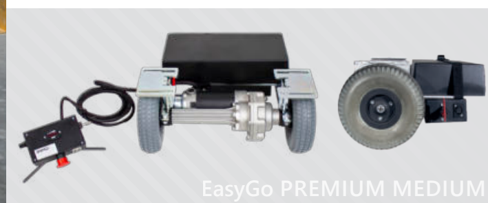
EasyGo PREMIUM MEDIUM